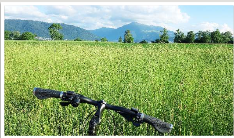
Journey guide pages: Into Farmlands of the Middle Lakeland